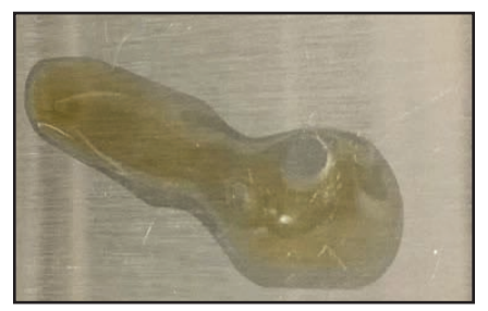
Rosin based flux on stainless steel test coupon