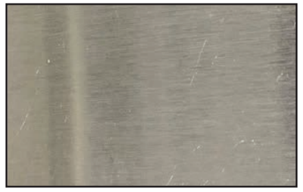
Test coupon after cleaning with Flux-Off No Clean Extra