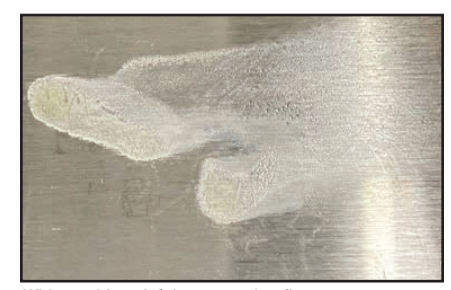
White residues left by competing flux remover