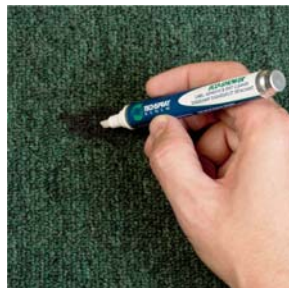
Ink removal from carpet